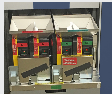
AC7500 Coin Hoppers

With efficiency gains, many companies have seen ROI in as little as 12 months